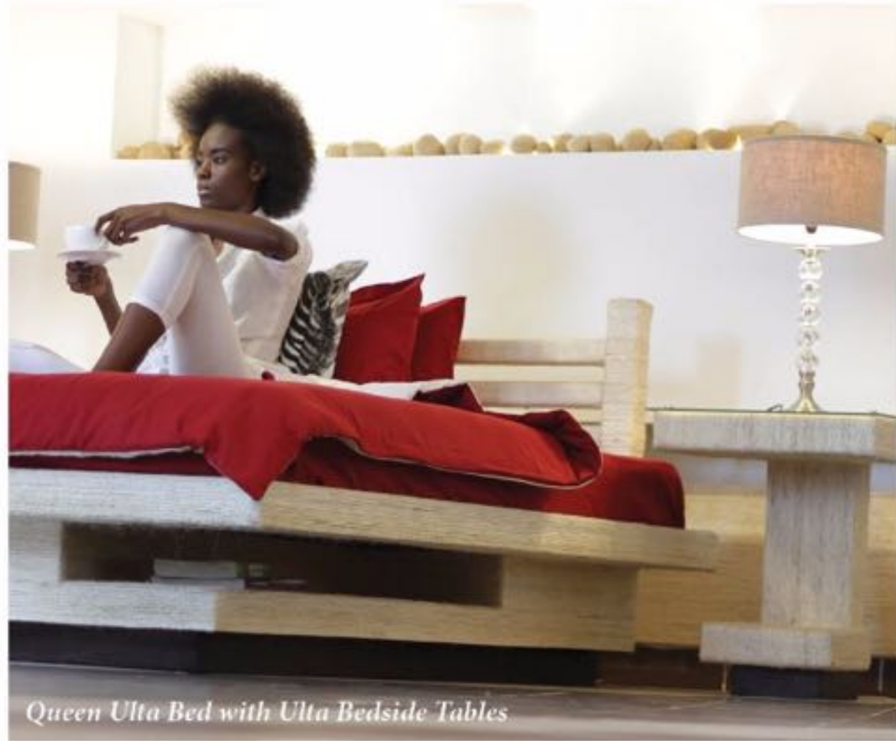
Queen Ulta Bed with Ulta Bedside Tables

Indeed, one of the most intriguing features of Decor Interiors' approach has been the way in which the concept lends itself towards the empowerment of women who learnt to sustainably extract the fibre from the easily accessible sisal plants from their homes. In so doing, families were endowed with a steady source of income, while still fulfilling their household duties. The end result is the development of a broad portfolio of products, innovative in design and practical application while setting the benchmark locally and globally in terms of the standards that can be achieved from an indigenous industry. The Collection of Furniture, Lighting and Accessories requires minimal care and maintenance, while offering a life long product performance.