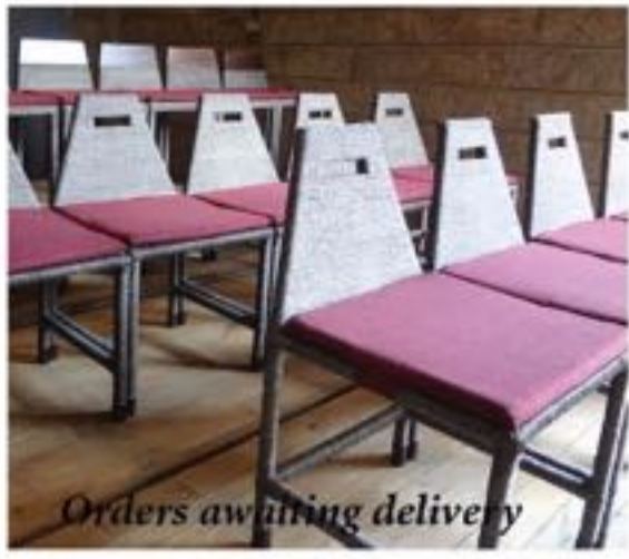
Orders awaiting delivery