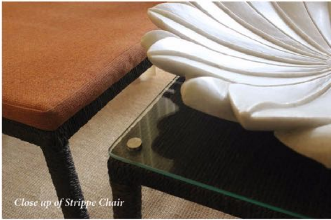
Close up of Strippe Chair