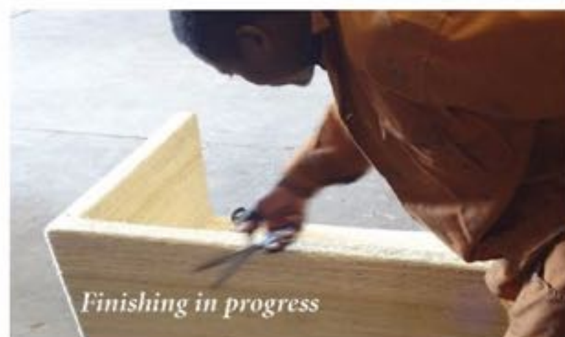
Finishing in progress