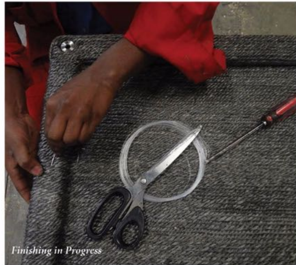
Finishing in Progress