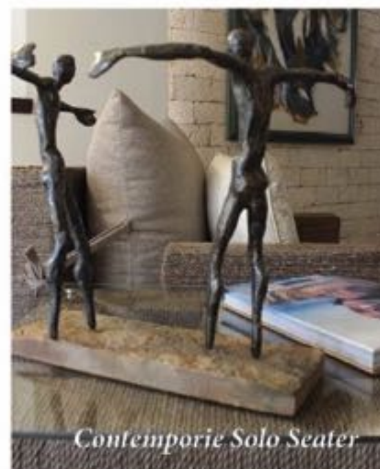
Contemporie Solo Seater

Decor Interiors Showroom and Design Studio 1st Flr, Tsavo Block, Eldama Park At Junction of Eldama Ravine and Peponi Roads Opp. About Thyme Restaurant, 5 minutes from Westgate Tel: 020 4401427, 0715 936 654 enquiry@decorinteriorskenya.com | www.decorinteriorskenya.com